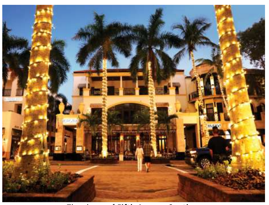
The shops of Fifth Avenue South