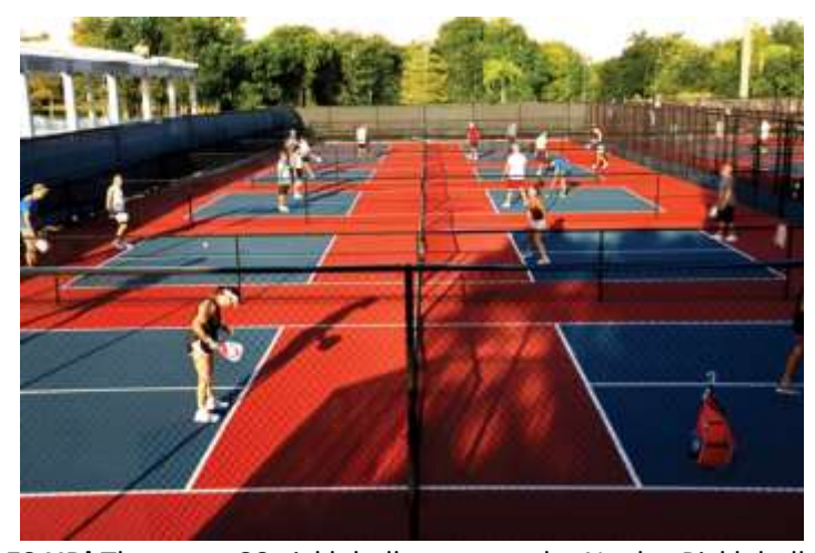
PADDLES UP! There are 66 pickleball courts at the Naples Pickleball Center.

"Having different courts for different levels of play is one of the best parts of this facility," says Crane. "People just starting out don't feel intimidated, the more experienced players get good play, and the ones who are trying to make a career out of pickleball can go to the 4.0+ courts."