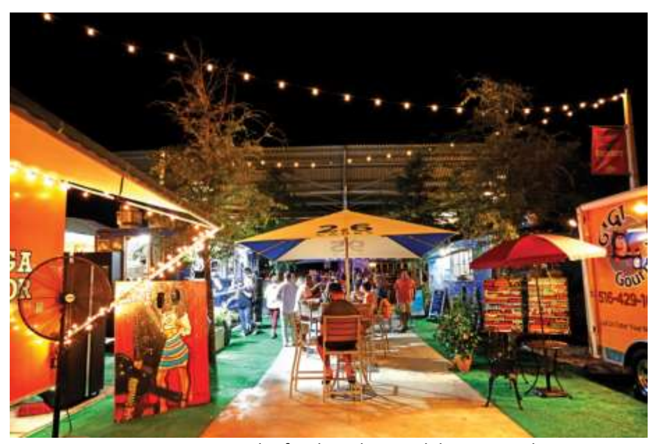
LIFE IS A BANQUET The food trucks at Celebration Park

For a casual night out with drinks, bites, and music, try <u>Celebration Park</u>, near East Naples Community Park. On a recent Saturday night, the food corridor featured four food trucks on each side, with offers ranging from burgers to seafood (including Jamaican jerk snapper) to barbecue to Mexican, as well as ice cream treats for dessert. The Old School Band, which plays classic rock songs, provided the soundtrack, with 60-something couples dancing to tunes like "Stuck in the Middle with You."