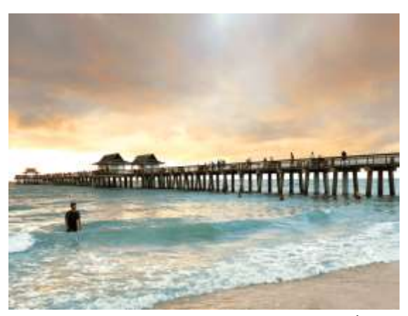
ON LAND AND OUT TO SEA A trip to the Naples Pier, especially at sunset, is a must.