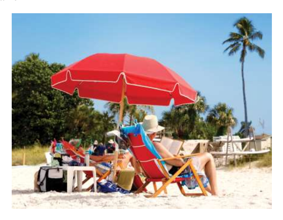
Relaxing at Lowdermilk Park

Naples has more than 10 miles of shoreline, providing plenty of options for beachgoers. Shell collectors often flock to <u>Lowdermilk Park</u>, one of Naples's loveliest spots, where visitors can find plenty of sand dollars and starfish.