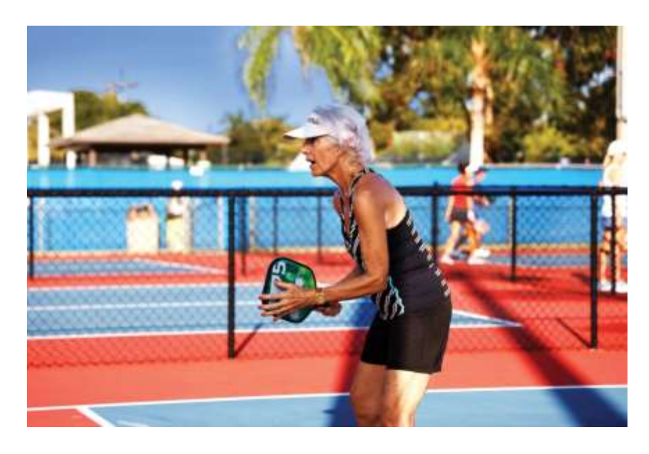
On the court at Naples Pickleball Center

But don't stay out too late. You'll want to hit the pickleball courts in the morning.