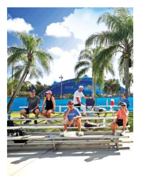
Players awaiting their turn

You can't miss this pickleball "ambassador" in her brightly colored shirt