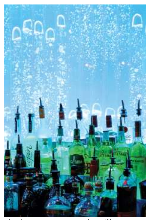
The bar at Watermark Grille

If you're looking for a great place for breakfast after a satisfying couple of hours playing pickleball, go where the locals go: <u>Blueberry's</u>. The laid-back restaurant offers indoor and outdoor seating, and the blueberry pancakes are a house specialty. (A stack of four costs $8.49.)