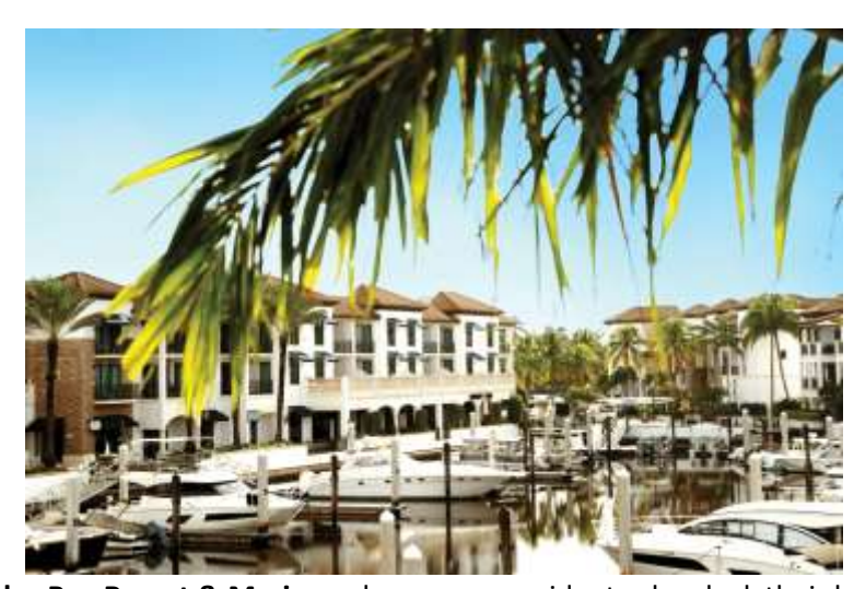
Naples Bay Resort & Marina , where many residents also dock their boats.

Located near downtown Naples and a little over three miles from East Naples Community Park is the 22-acre AAA four-diamond Naples Bay Resort & Marina. The hotel offers access to the resort's private Naples Bay Club, with a free shuttle running between the two locations. While the resort doesn't have any pickleball courts on the premises, it does offer six tennis courts for those who play both sports. A double room starts at $274 a night May through September and from $475 October through April. Another option is to rent one of the resort's two- or -three-bedroom cottages, which are available for a minimum six-night stay. Prices start at $174 per night off-season and $400 per night in season.