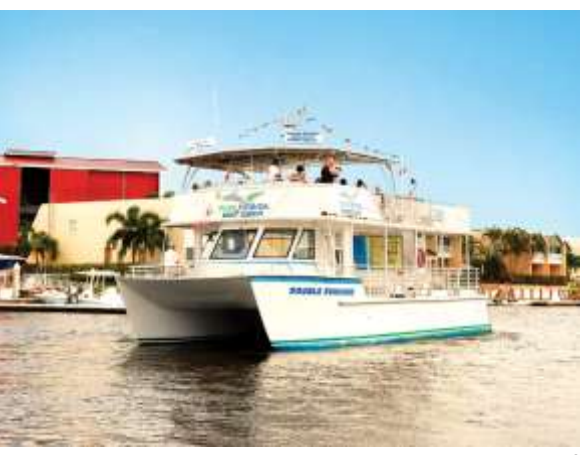
A Pure Florida boat heading out to the Gulf of Mexico.

But don't stay out too late. You'll want to hit the pickleball courts in the morning.